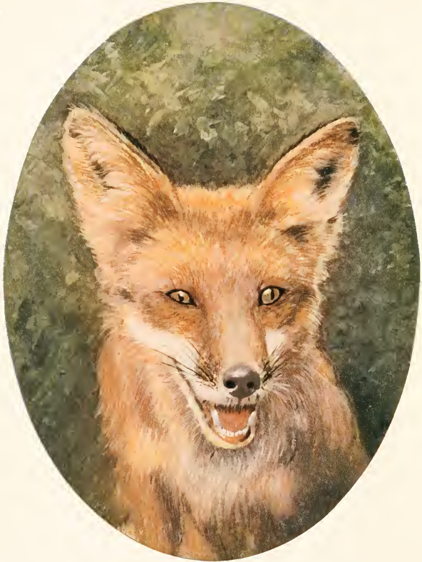
RED FOX. (PAGE 53)